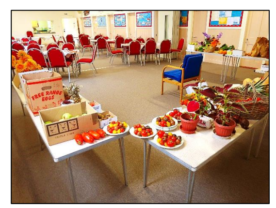
Tables prepared for the supper and produce ready for the sale

food gain! – and the sale of surplus produce with our ever-entertaining auctioneer, John Germain – just don't rub your nose or you may be landed with an oversized melon!